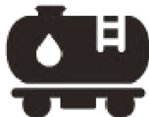
SHIP & OIL RIGS