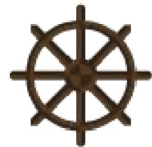
ON SHORE & OFF SHORE INDUSTRIES