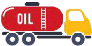
OIL & GAS INDUSTRIES

Rope access's safe system of work provides a solution to access inaccessible areas and complete task without compromising safety. Many major industries have been utilising rope access methodology for their work at height activities and difficult to access areas